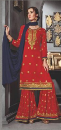
D.no : 1003