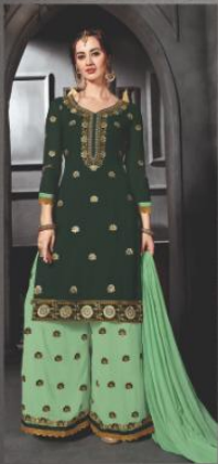
D.no : 1005