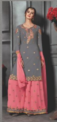
D.no : 1007