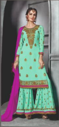
D.no : 1001