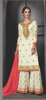
D.no : 1004