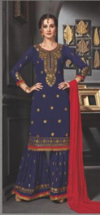
D.no : 1002