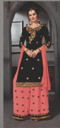
D.no : 1008