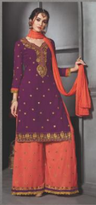
D.no : 1006