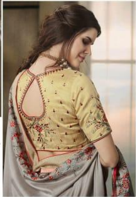
The Vibrancy colour and design of this collection are sure to never disappoint. 8710