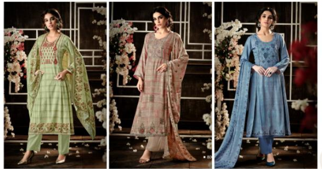
■ 6004 ■