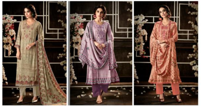
■ 6001 ■