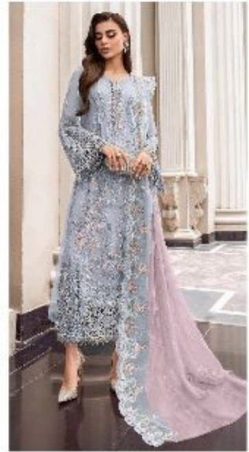
C - 1707 C