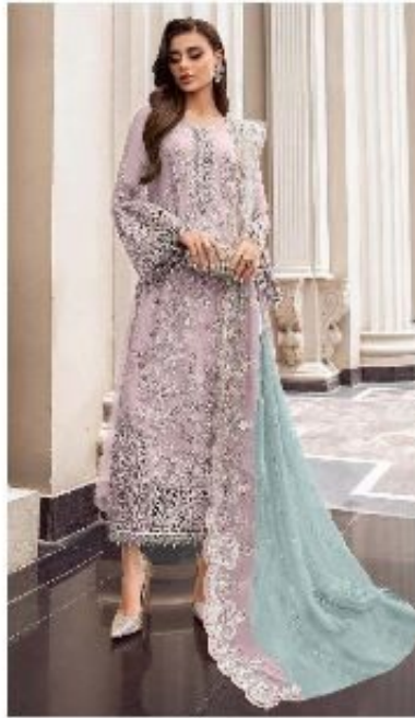
C - 1707 B