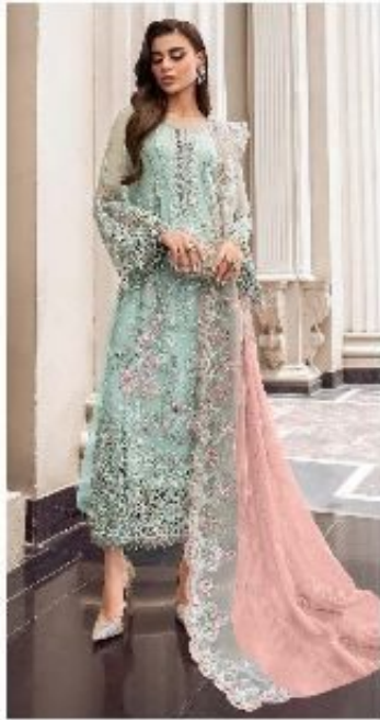
C - 1707