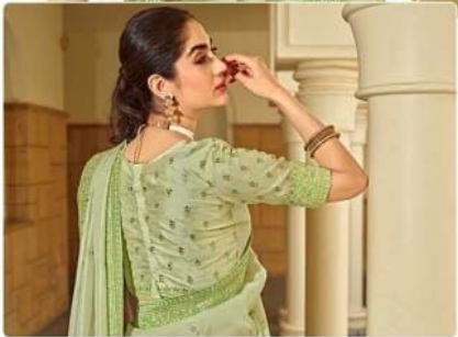
Embellished with heavily, contrast with Eranese, each same falls a tale of fabrics, no gorgeous.