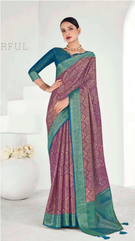
8303 A soothing three-piece fashion statement is all set to make your evening the most delightful!