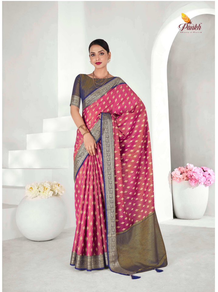
a festive colour palette to swing up your happy going chirpy mood. 8304