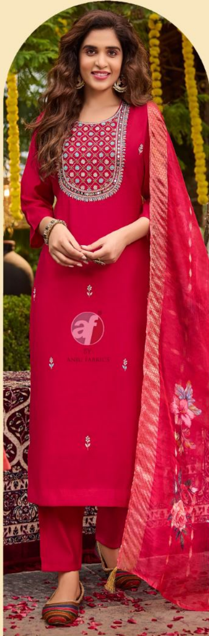
SHARARAT VOL-07 3825