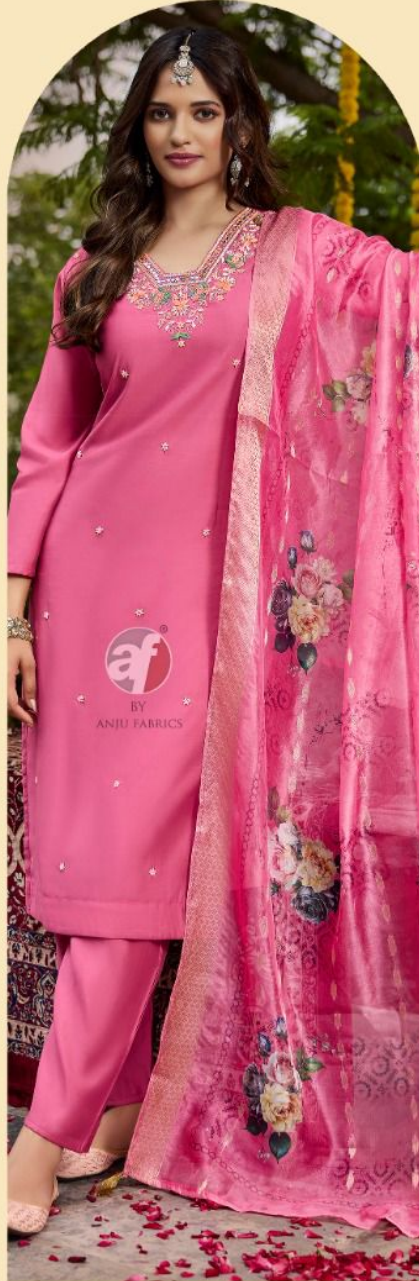
SHARARAT VOL-07 3822