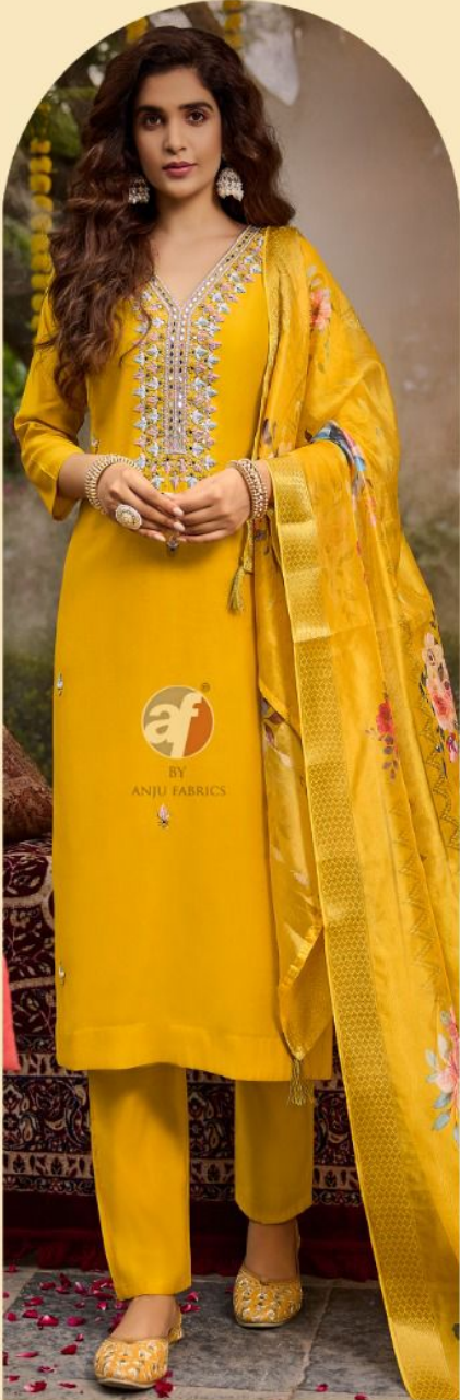
SHARARAT VOL-07 3821