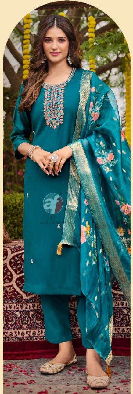
SHARARAT VOL-07 3826