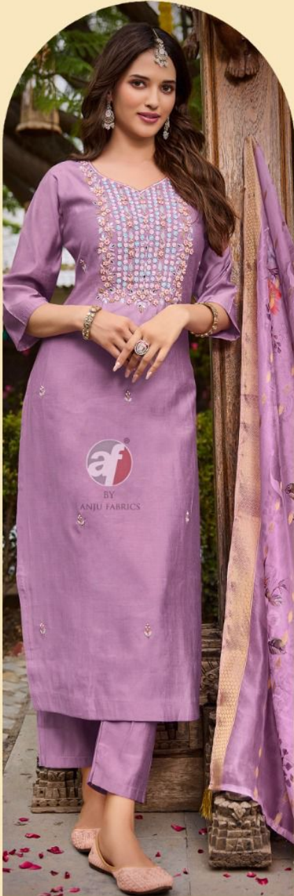
SHARARAT VOL-07 3824