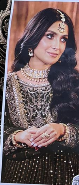
CHANTELLE ZA Vol-10 TOP Butterfly net with Embroidery BOTTOM-INNER Dull Santoon DUPATTA Butterfly net with Embroidery