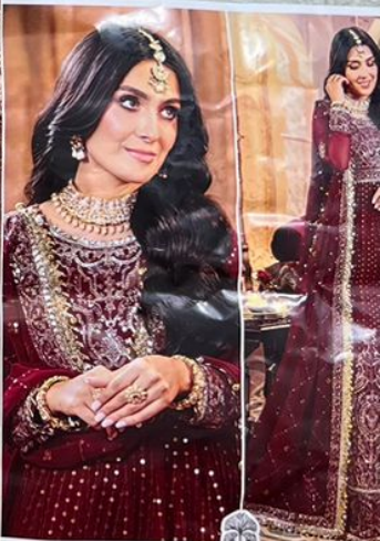
CHANTELLE ZAHA D.NC Vol-10 TOP Butterfly net with Embroidery BOTTOM INNER Dull Satoon DUPATTA Butterfly net with Embroidery