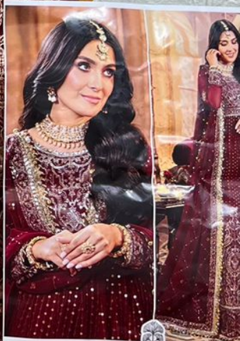
CHANTELLE ZAHA D.NC Vol-10 TOP Butterfly net with Embroidery BOTTOM INNER Dull Satoon DUPATTA Butterfly net with Embroidery