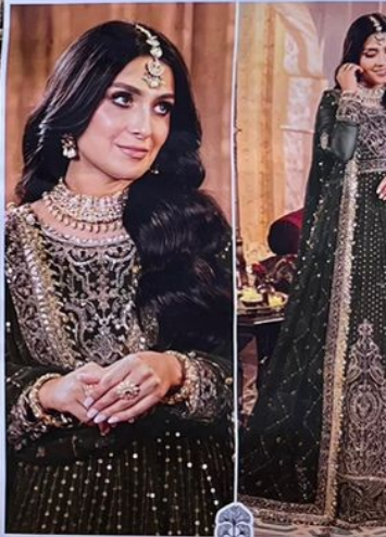
CHANTELLE ZAHA D.No.1 Vol-10 TOP Butterfly net with Embroidery BOTTOM INNER Dull Satoon DUPATTA Butterfly net with Embroidery

CARE INSTRUCTIONS 1. Do not wash 2. Do not iron 3. Do not dry clean