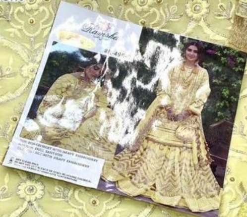
Emb Net Bottom