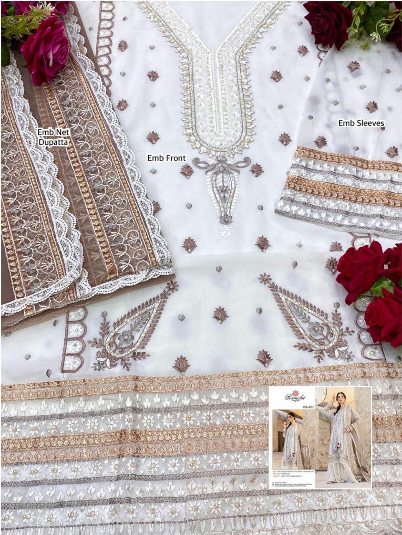
Emb Net Dupatta