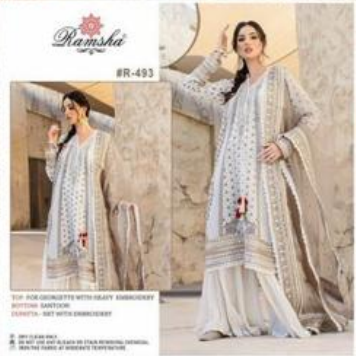
TOP: 100% COUNITTE WITH HEAVY EMBROIDERY BOTTOM: SATIN DUPATTA: NET WITH EMBROIDERY

© 2015 RAMSKA WEAVE AND MAKE IN PAKISTAN ALL RIGHTS RESERVED