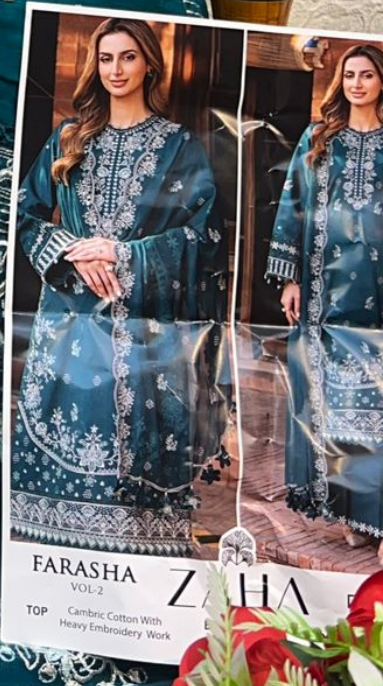
FARASHA VOL-2 ZAHARA TOP Cambic Cotton With Heavy Embroidery Work