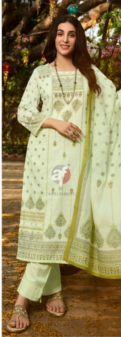
D.no.37522 Flairs VOL-3