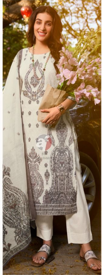
D.no.3723 Flairs VOL-3