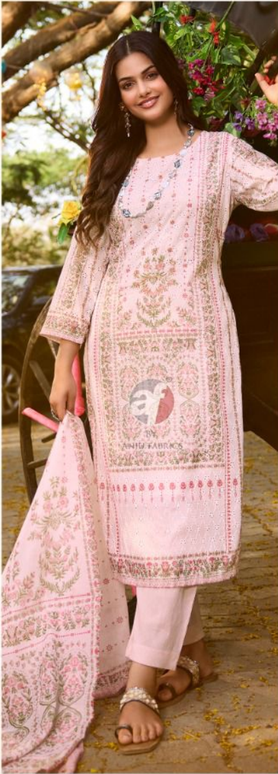
D.no.3724 Flairs VOL-3