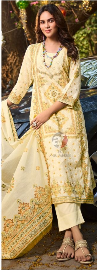
D.no.3725 Flairs VOL-3