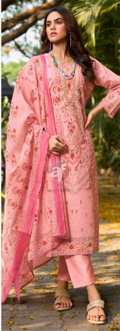
D.no.3721 Flairs VOL-3