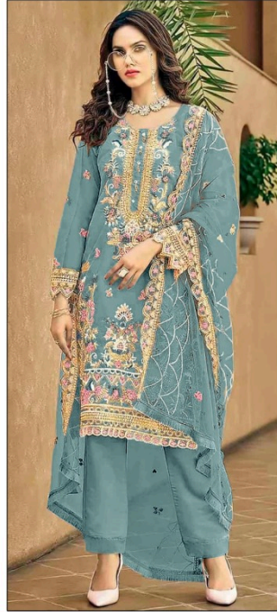
S - 275 G