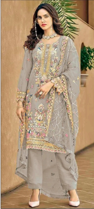
S - 275 E