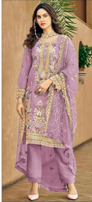
S - 275 F