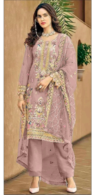
S - 275 H