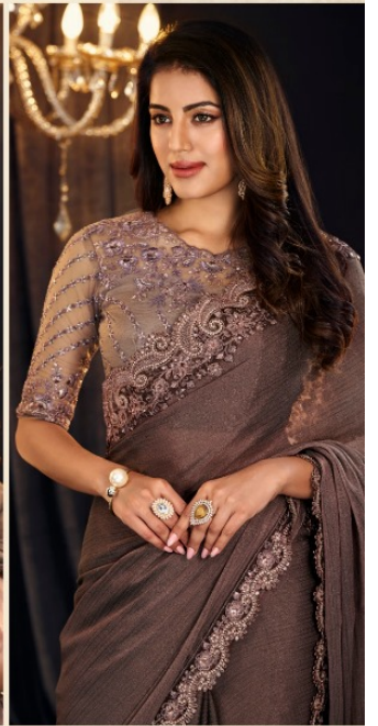
Design No .13003