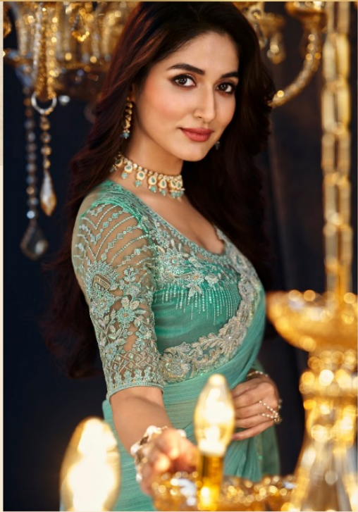
Design No. 13007