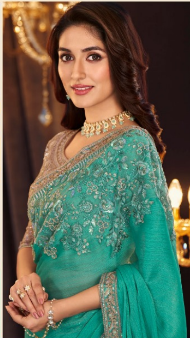
Design No .13005