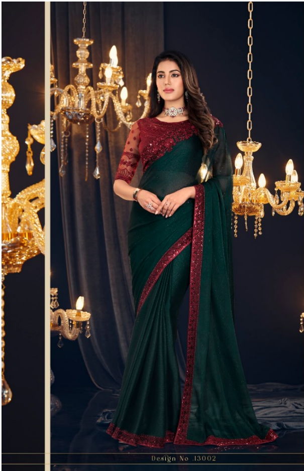
Design No -13002