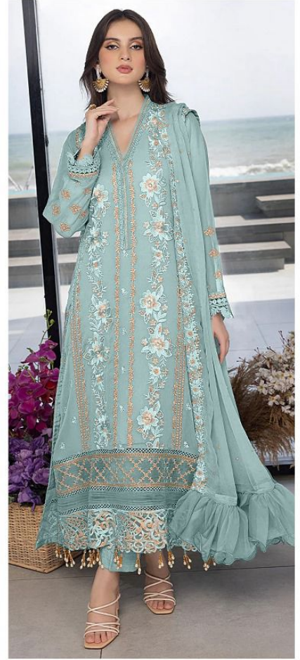
C - 1609 F

Rosemeen ® Styled for your comfort by Fepic