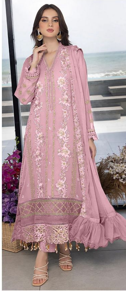
C - 1609 E

Rosemeen ® Styled for your comfort by Fepic