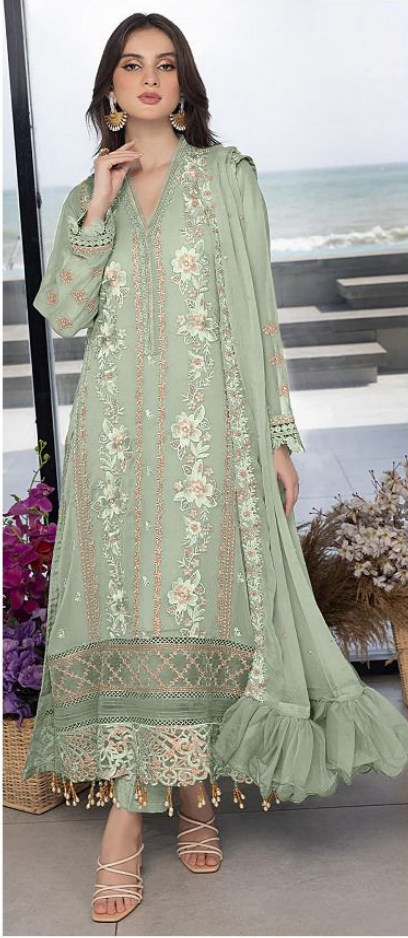
C - 1609 D