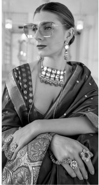
Be style icon in any occasion by wearing this beautifully crafted designer saree and will surely get you great compliment.

RAPATH The Spirit of Rajasthan WOVEN SILK