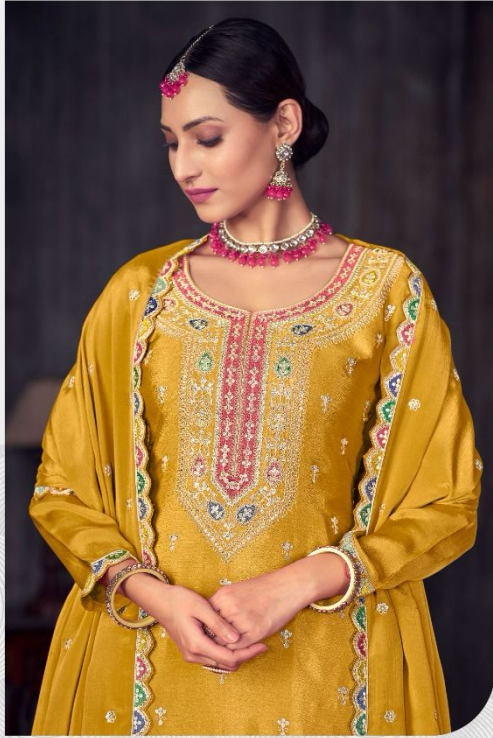
The flare of subtle ethnic wear that meets the contemporary glam vividly explodes with minute details of elegance