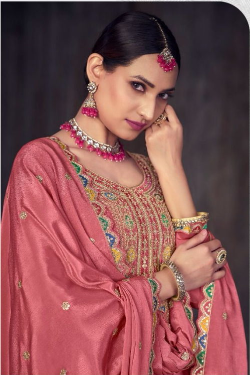
A blend of colors that highlight every corner of the attractive designs that in turn adorn you with vast beauty