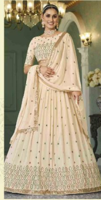
CODE : 176