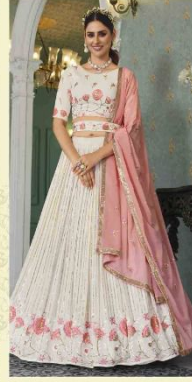
CODE : 174