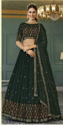
CODE : 175