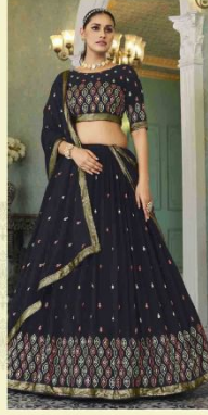
CODE : 173