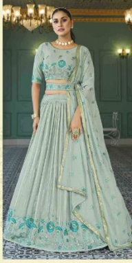
CODE : 172