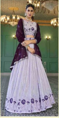
CODE : 171