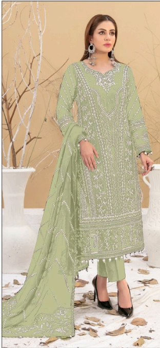
S - 271 A