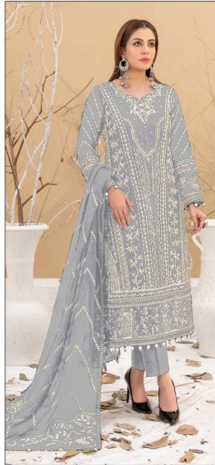
S - 271 B