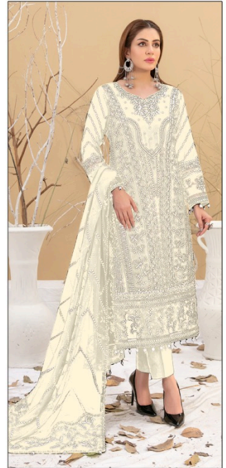
S - 271 D