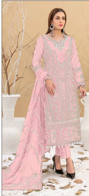
S - 271 C