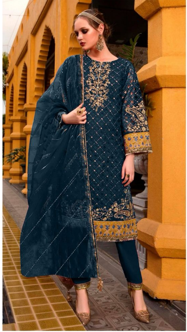
C 1342 B