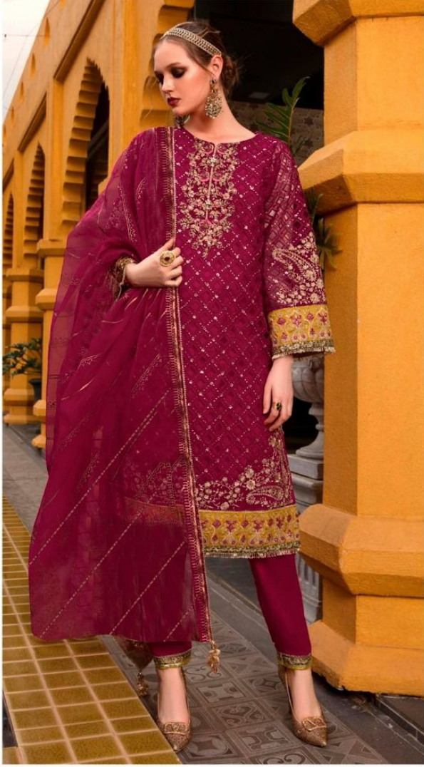
C 1342 A