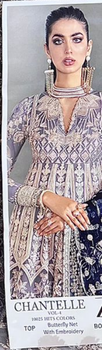
CHANTELLE VOL. 4 10025 1015 COLORS Butterfly Net TOP With Embroidery