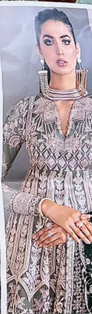
CHANTELLE VOL-1 1025 HITS COLORS TOP Butterfly Net With Embroidery