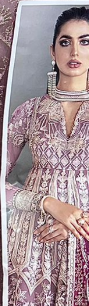
CHANTELLE VOL. 4 10025 NETS COLORS Butterfly Net With Embroidery