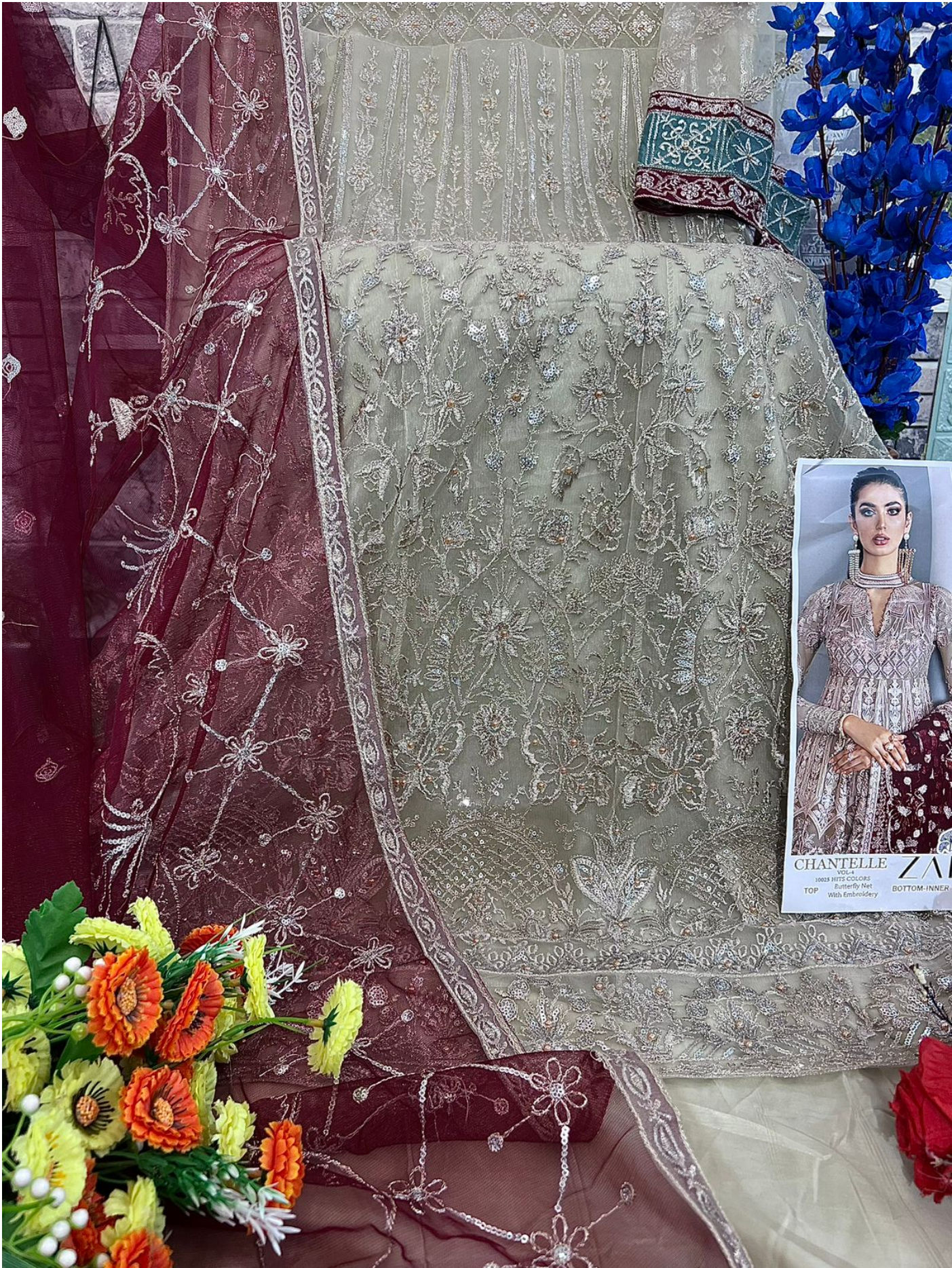
CHANTELLE ZAI 10025 FITS COLORS TOP Butterfly Net With Embroidery BOTTOM-INNER