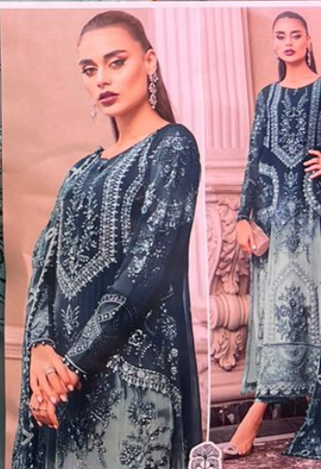
ZAHA D.No TOP Faux Georgette with Embroidery (Cut-2.5 Mtr) BOTTOM-INNER Dull satin (Cut-4.2 Mtr) DUP