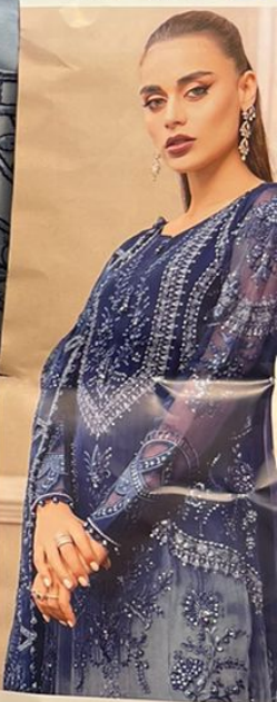
TOP Faux Georgette with Embroidery (Cut-2.5 Mtr)