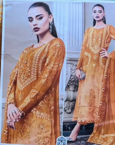
ZAHN D.No.10229 TOP Faux Georgette with Embroidery (Cut-2.5 Mtr ) BOTTOM: Faux Georgette with Embroidery (Cut-2.5 Mtr ) DUPATTA with Embroidery (Cut-2.5 Mtr )