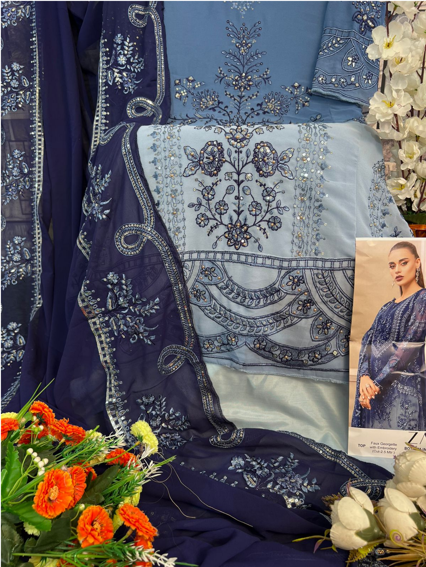
TOP Faux Georgette with Embroidery (Cut-2.5 Mtr)