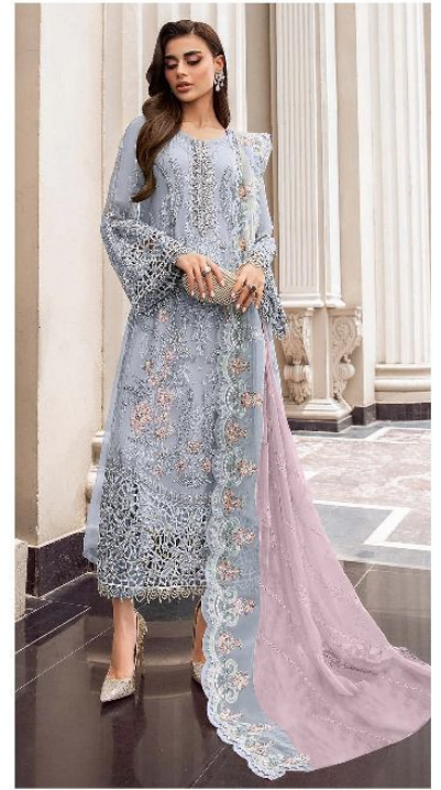
C - 1707 C