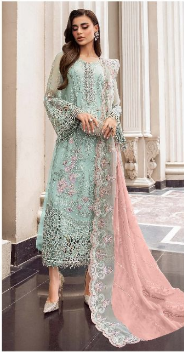
C - 1707