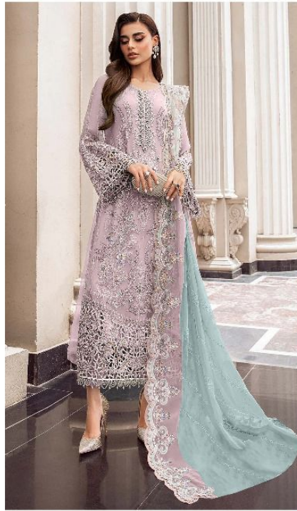
C - 1707 B