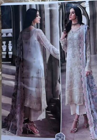
GULAAL VOL-1 TOP Faux Georgette with Embroidery ZAHA DUPATTA Dull santoon D.No.1