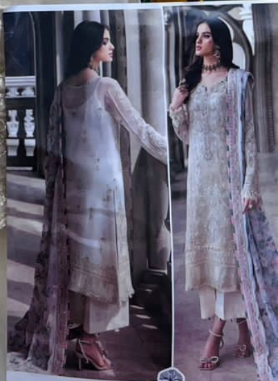
GULAAL VOL-1 TOP Fabric: Georgette with Embroidery