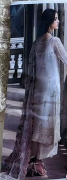
GULAAL VOL-1 TOP Faux Georgette with Embroidery Z A BOTTOM-INV