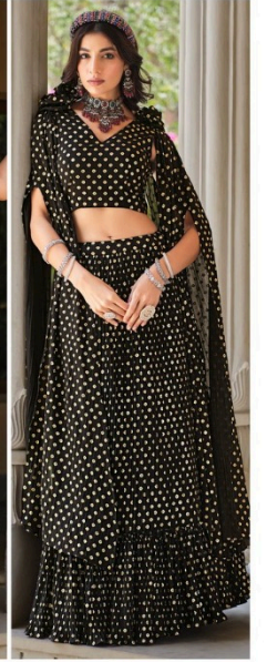
CODE | 2326