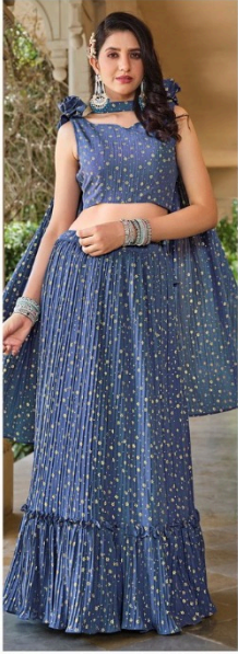
CODE | 2322