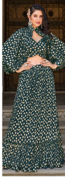
CODE | 2324