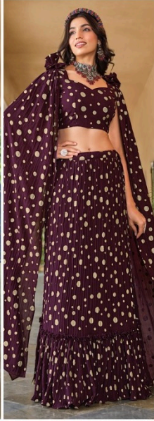
CODE | 2323