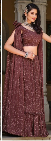
CODE | 2325