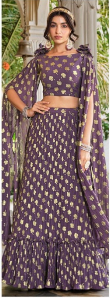
CODE | 2321