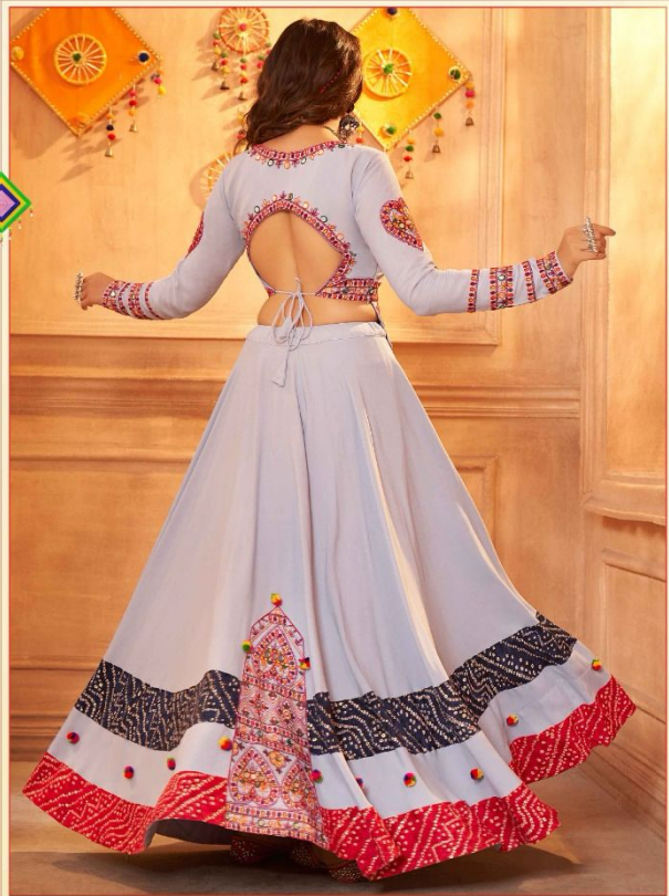
Classic never goes out of style 2359