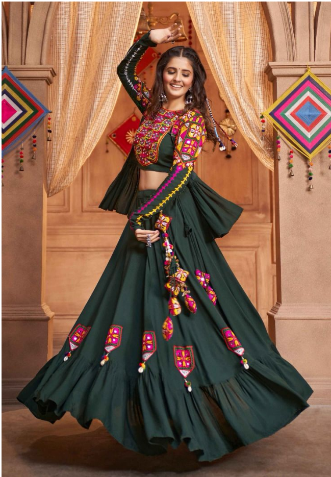
Blasting the Fashion of Day 2358