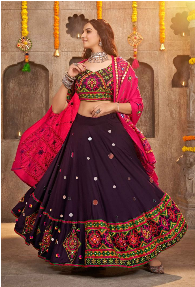
Fashioning You! 2339