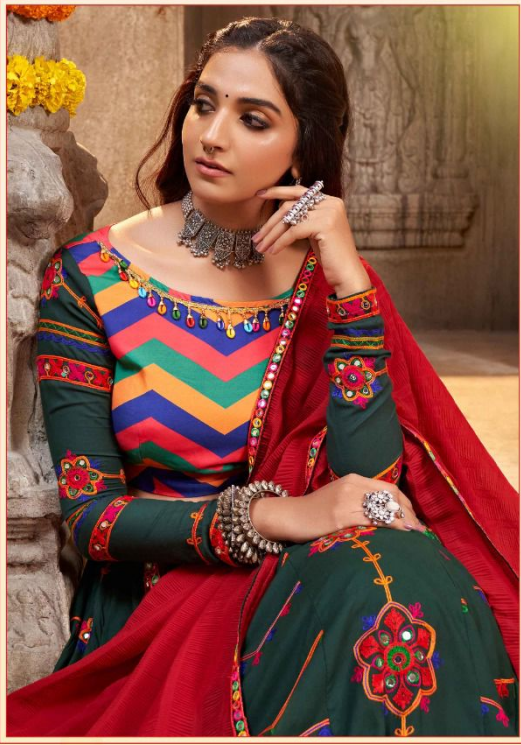
Smart sense of fashion