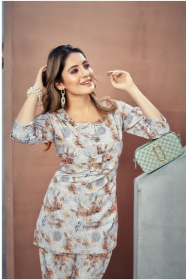
Brings out the brand's classics and reinvents them into