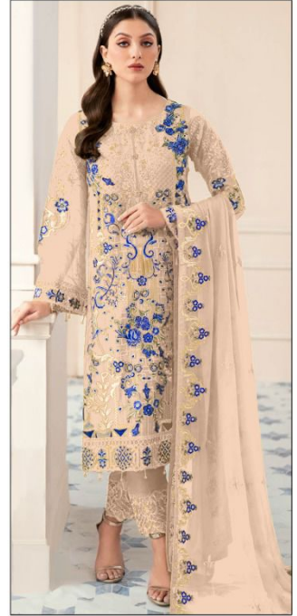
S - 116 H