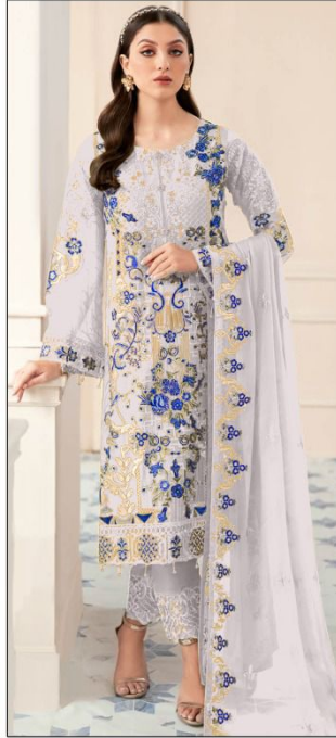
S - 116 G