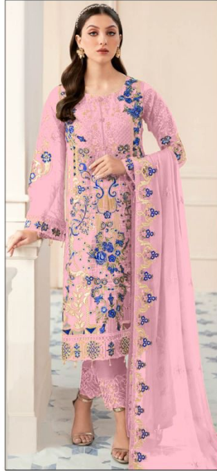
S - 116 F