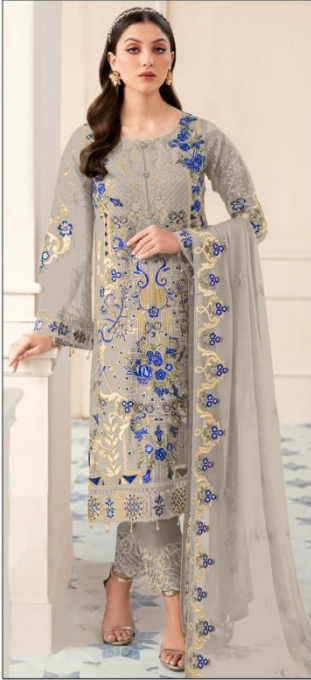
S - 116 E