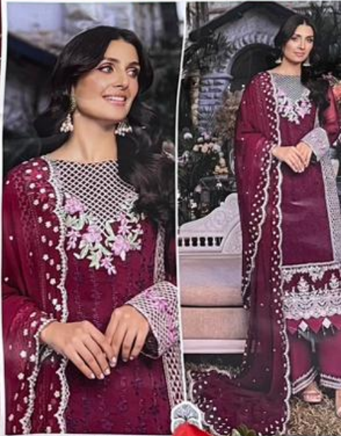
KHUSHBU Vol-5 TOP Faux Georgette with Embroidery Z BOTT No.10137