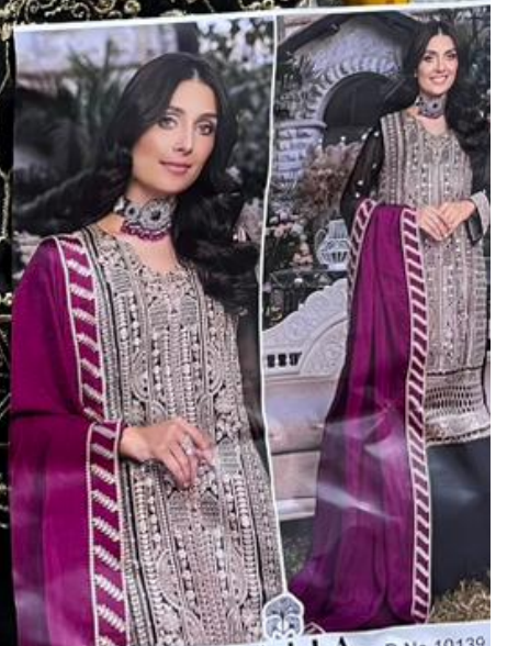
KHUSHBU Vol. 1 ZAHA D.No. 10139 TOP: Fake Georgette with Embroidery | BOTTOM-INNER: Dull Satton | DUPATTA: Namika Embroidery