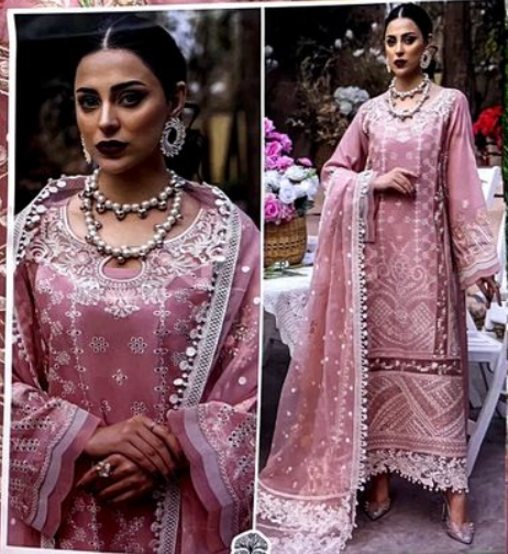
ALAYNA VOL-2 ZAHA D.No.10194 TOP: Cambric Cotton With Heavy Embroidery Work BOTTOM-INNER Semi Lawn DUPATTA Butterfly Net With Heavy Embroidery