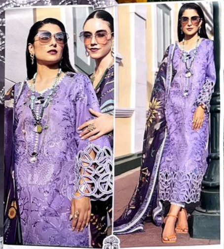
ALAYNA VOL-2 ZAHA D.No. 10195 TOP Cambic Cotton With Heavy Embroidery in Dupatta Tussly Silk With Print