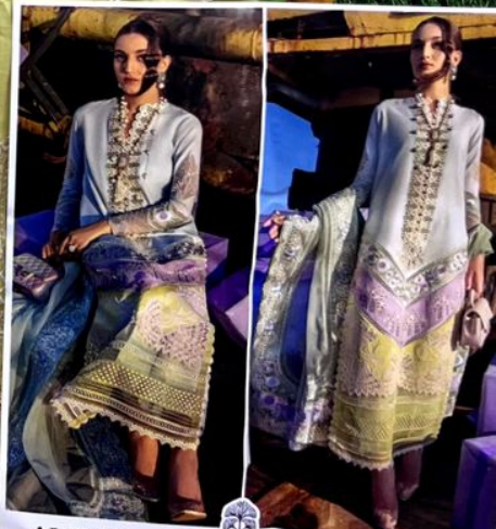
ALAYNA VOL. 2 TOP - Embroid Cotton With Heavy Embroidery Work ZAHA D.No. 10192 BOTTOM-INNER Semi Lining DUPATTA Butterfly Net With Heavy Embroidery