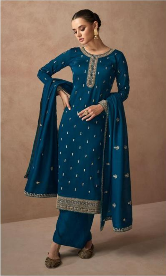
A | - 9565