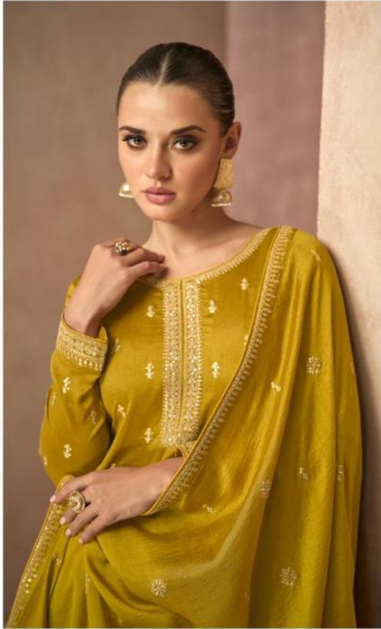
A | - 9569