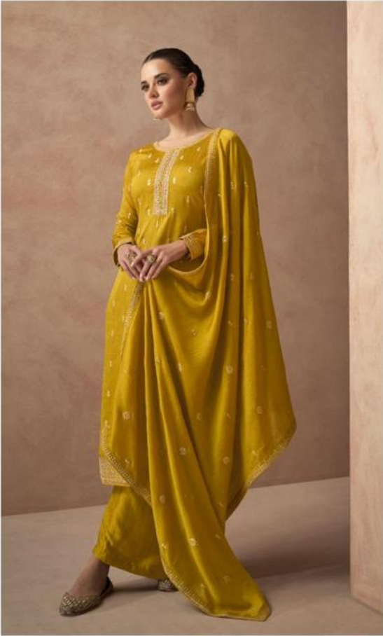
A | - 9569