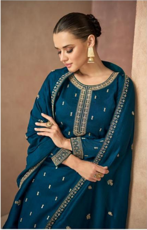
A | - 9565