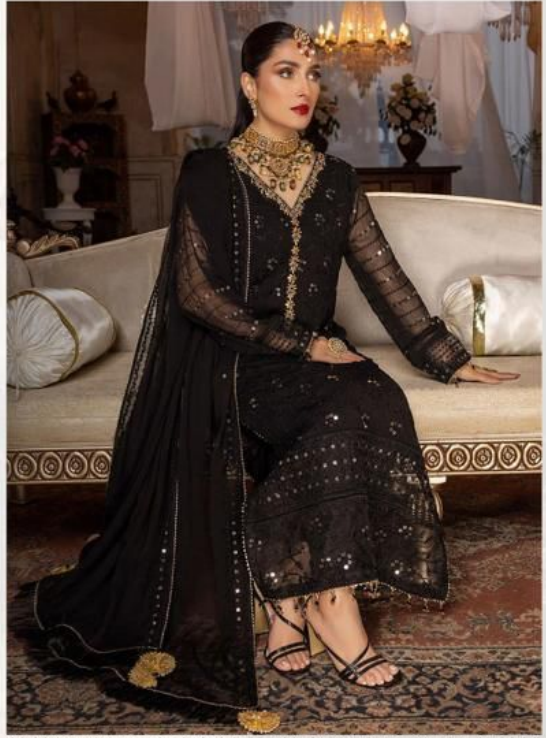
It is their dream to be in new trends and style whether it is traditional ones or modern ones or sometimes mixture. In India the girls more prefer to wear traditional ones where the comfort feature concerned as salwar kameez.