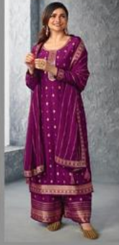
+ 61803 +