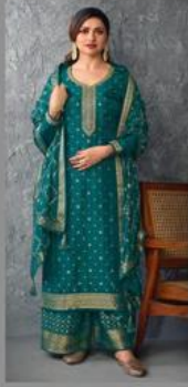
+ 61802 +