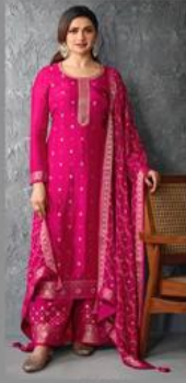
+ 61805 +