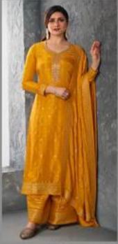
+ 61804 +