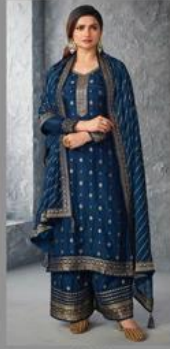
+ 61806 +