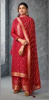
+ 61801 +