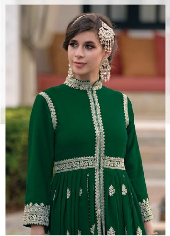
Fashion is architecture. It is a matter of proportions.