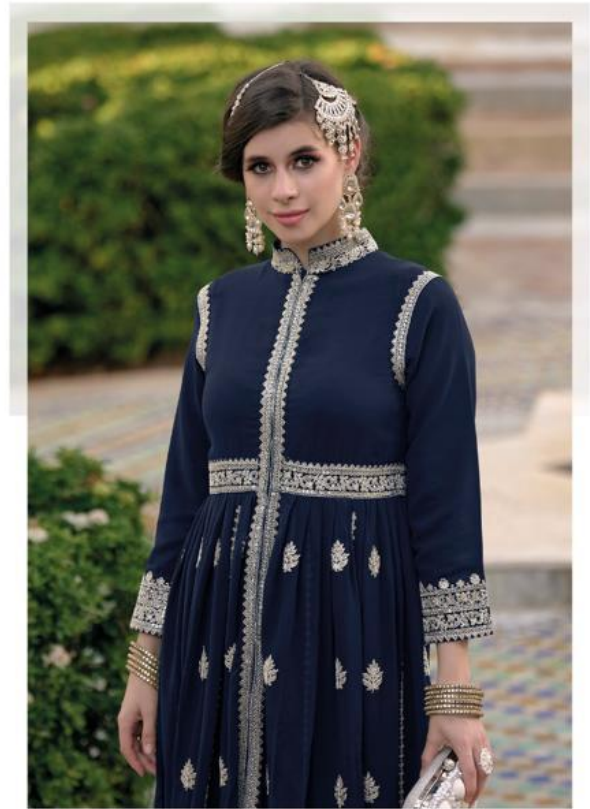
The difference between style and fashion is quality.