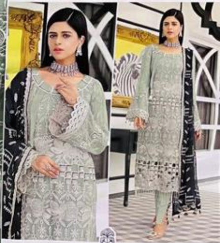
ZAHA D.No.10091-C TOP: Fiza Georgette with Embroidery BOTTOM-INNER: Dull Lattice DUPATTA: Namun with Embroidery