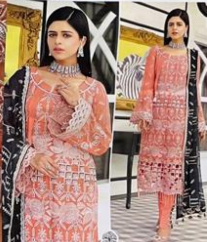
ZAHARA D.No.10091- TOP: Fine Georgette with Embroidery BOTTOM: INTRICATE EMBROIDERY