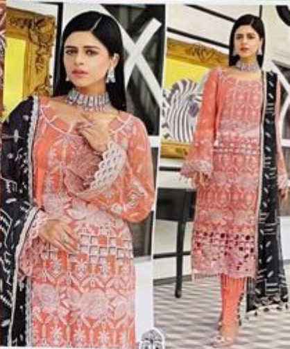
ZAHA D.No.10091- TOP: Peach Georgette with Embroidery BOTTOM: BLACK GEORGETTE WITH EMBROIDERY