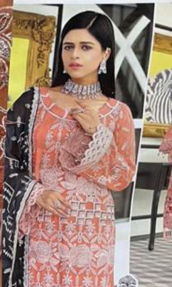
ZAHA TOP Fox Georgette with Embroidery BOTTOM-INT