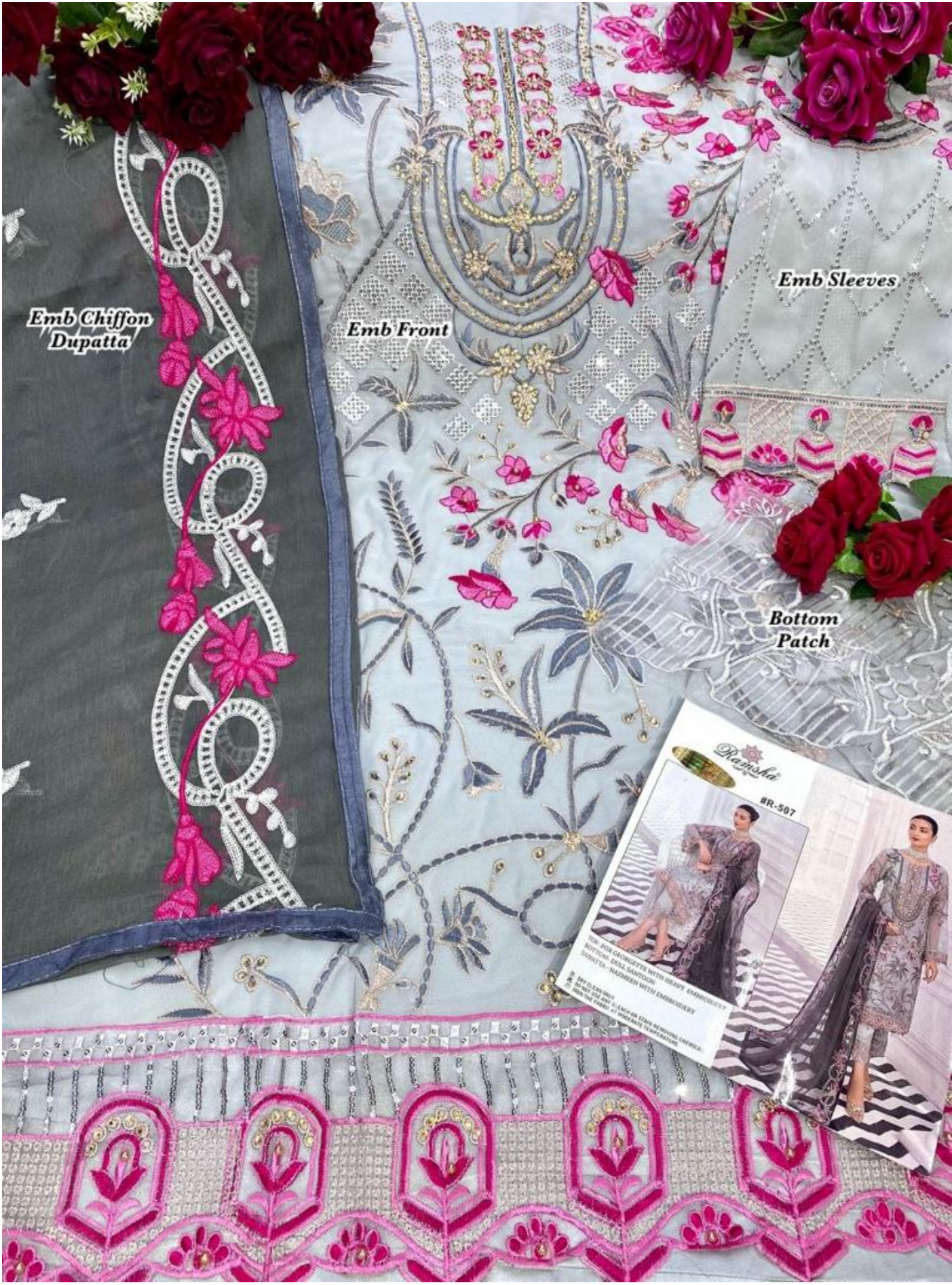
Emb Chiffon Dupatta