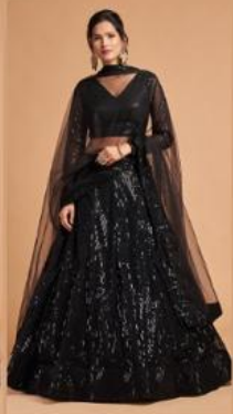
code # 7308