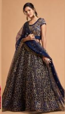
code # 7311