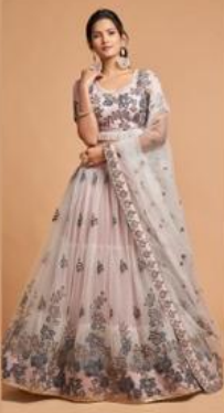
code # 7307