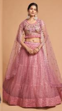
code # 7313