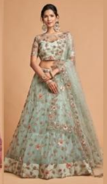
code # 7314