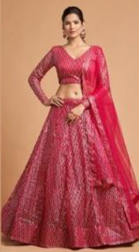
code # 7310