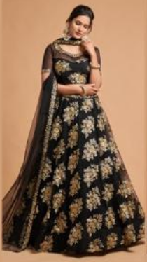
code # 7306