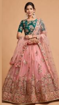
code # 7315