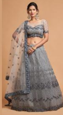
code # 7312