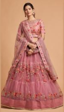
code # 7309