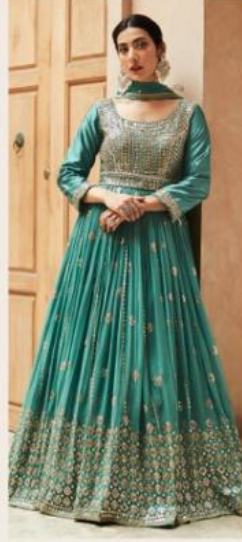
D.no - 9449