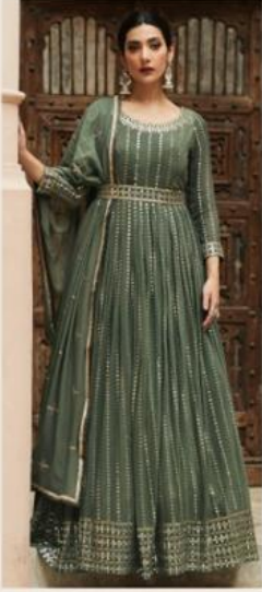
D.no - 9447