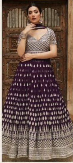
D.no - 9448