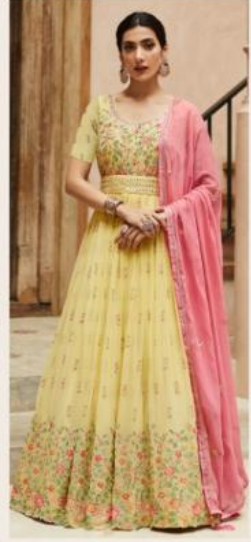
D.no - 9450