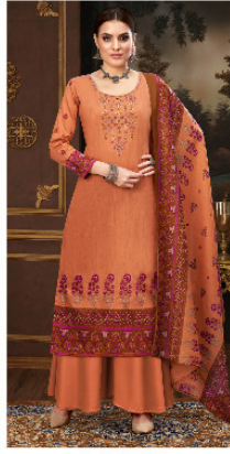
S 1062-003 இறுதி