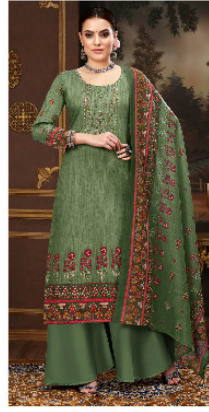
S 1062-004 இறுதி