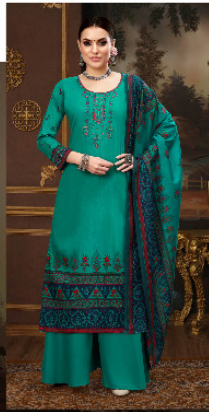
S 1062-007 இறுதி