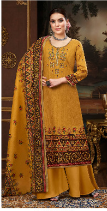
S 1062-001 இறுதி