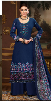
S 1062-008 இறுதி