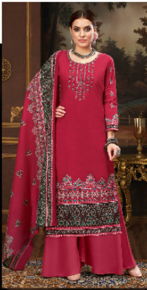
S 1062-005 இறுதி