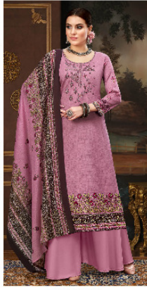
S 1062-002 இறுதி