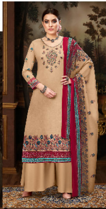
S 1062-006 இறுதி