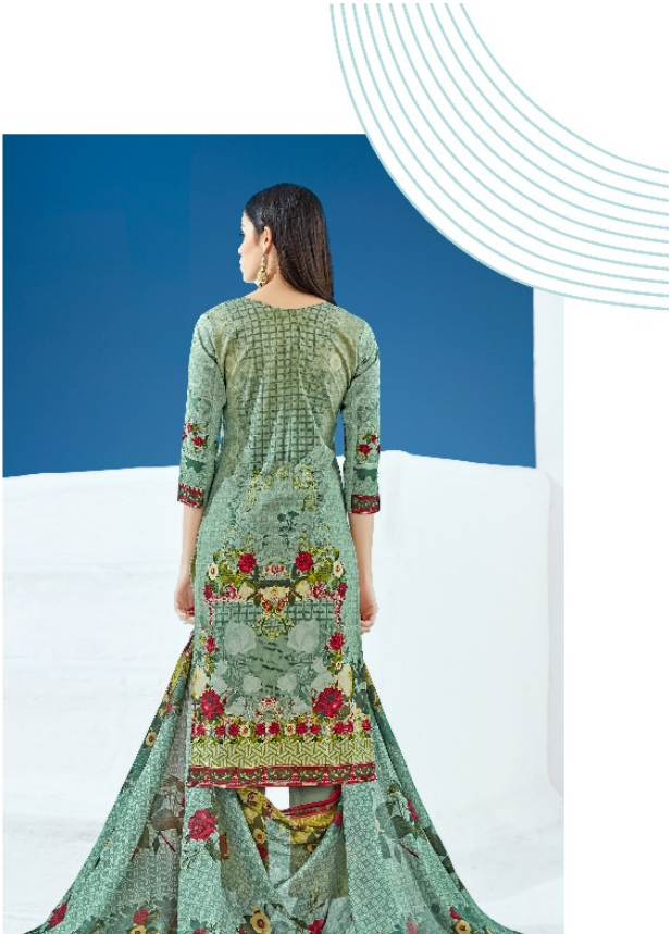
CODE # 1008 The beauty of a woman must be seen from in her eyes because that is the doorway to her heart, the placewhere love resides