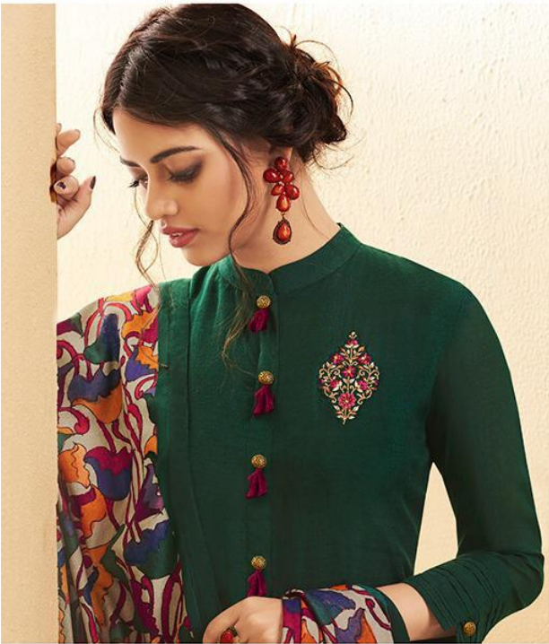
DAZZLING DIVA- Shine like divas on the here, Its a time to shine.