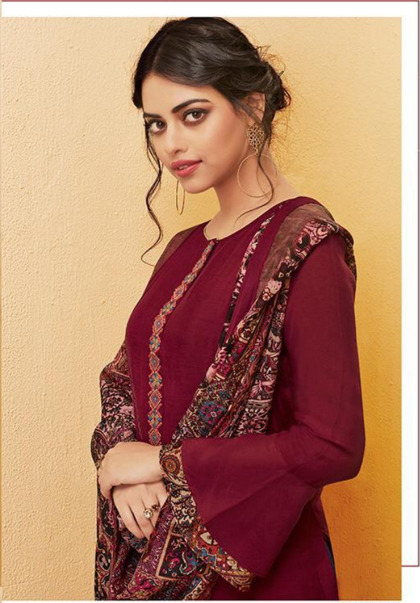
GLAM SQUAD- everything you need to cloth your party look.