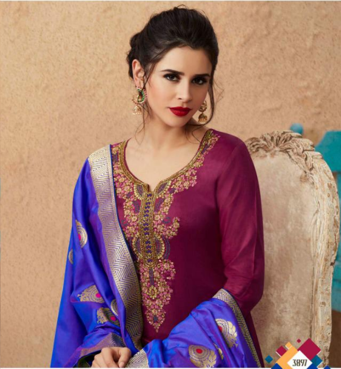
6. As the season of festivities knocks on our doors, get ready with the most amazing festive attires.