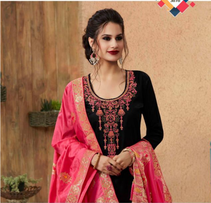
Up your fashion game with grace and style adorning fine designed dresses embellished with delicate work.