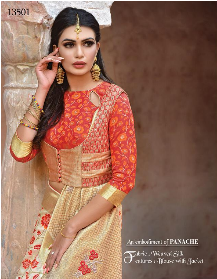
An embodiment of PANACHE Fabric : Weaved Silk Features : Blouse with Jacket