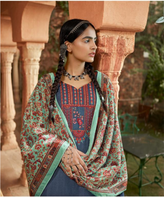
Indulge in the hue royalty this season and envelope yourself in luscious shades and contemporary designs. Code:-1002