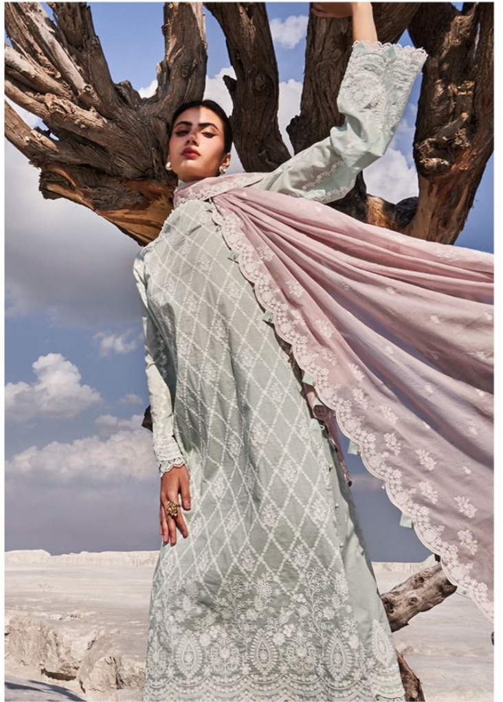
IMAGE CHIKANKARI COLLECTION D.NO.46023