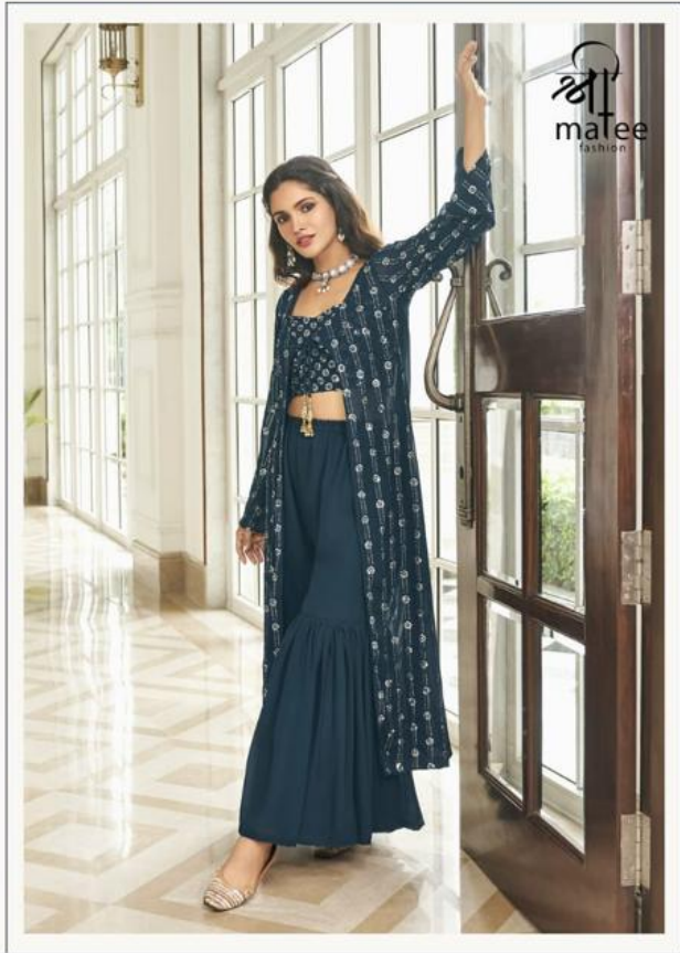
My fashion is about the urban woman in the year. I think about obscure, weird things and try to create a world around them CODE 134