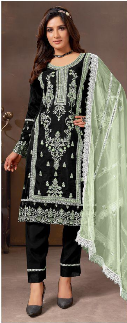
C - 1617 A