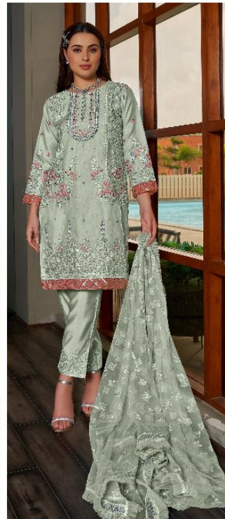
C - 1669 C