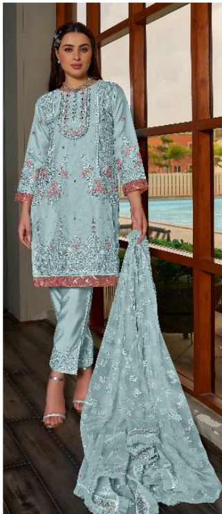
C - 1669