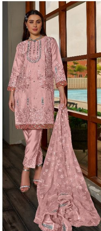
C - 1669 B