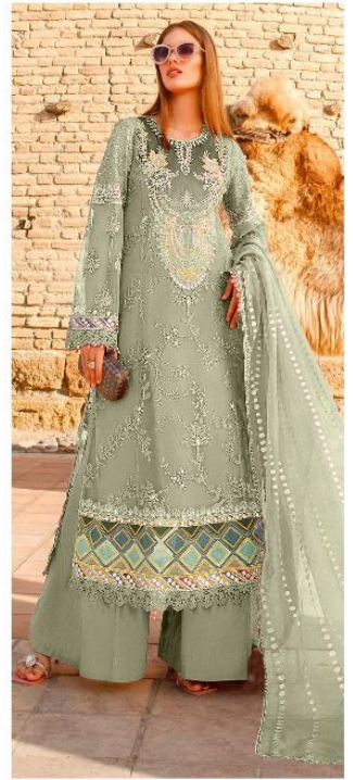
C -1343 D