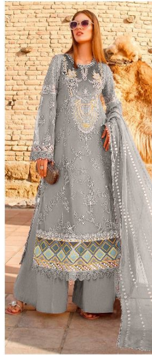
C -1343 C