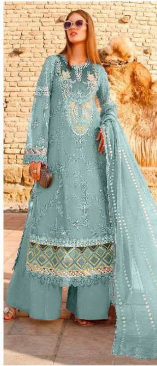
C -1343 B